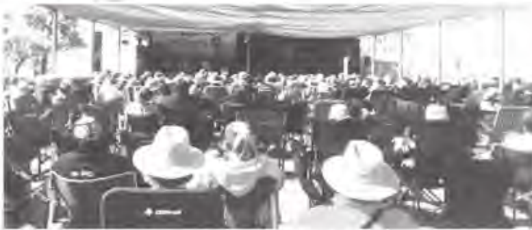
Central part of crowd at Nambung