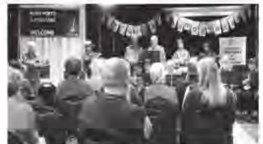
Euroa Ukelele group