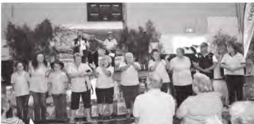
Tenterfield Oracle's wonderful Committee saying goodbye until 2010