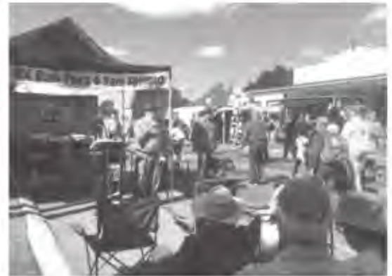
Mandurah - Toodyay