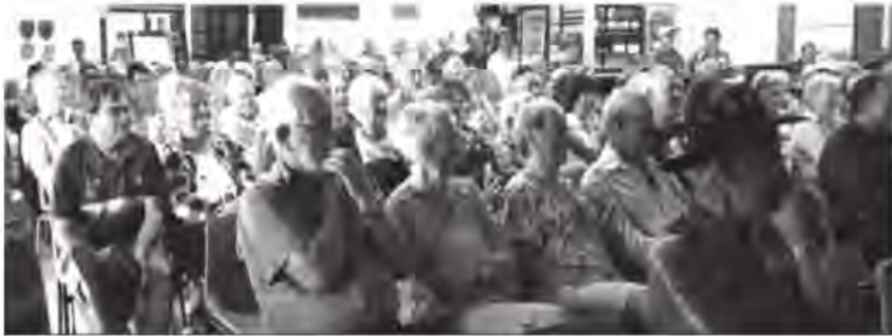
Bowling Club Crowd