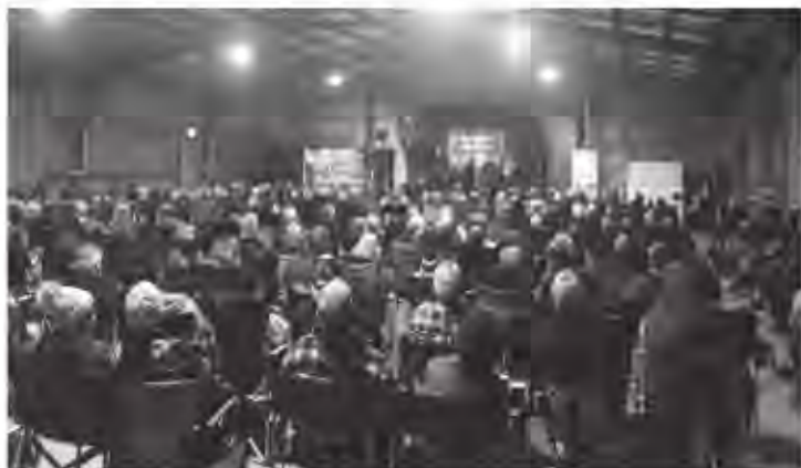
St. George Crowd enjoying the entertainment.

Australian music, Australian poetry and some quality camp oven catering all added up to deliver a weekend chock full of Australiana, and proved once again that there is a sizable audience, prepared to travel considerable distances to enjoy quality entertainment.