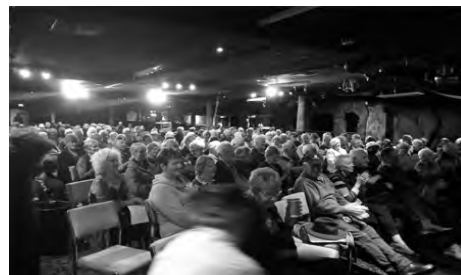
Mildura crowd enjoying the Poets Breakfast