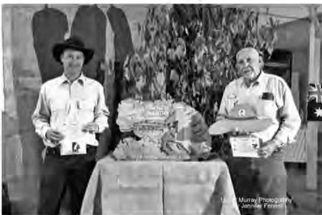
2016 ABPA VICTORIAN STATE CHAMPIONS PERFORMANCE CHAMPIONS