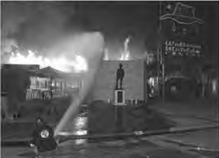
Local Fire Crews fight the early morning fire

The A.B.P.A. Community wish Winton all the best in a time when drought has caused such hardship, that this is another hurdle they can overcome.