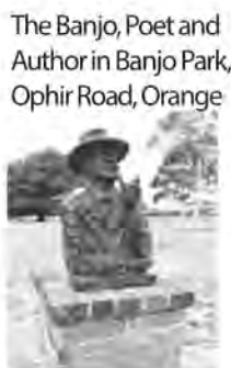
The Banjo, Poet and Author in Banjo Park, Ophir Road, Orange