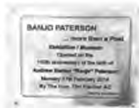
Plaque at the museum