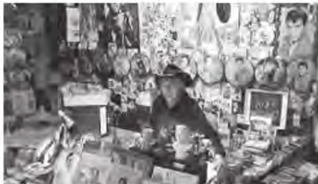
A tiny part of Harvey's Country Music Museum