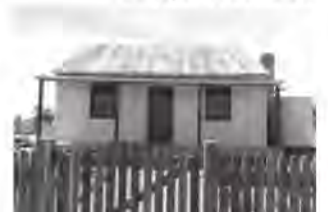
Emmaville in its restored state.