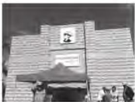
Banjo Paterson, More than a Poet Museum in Yeoval