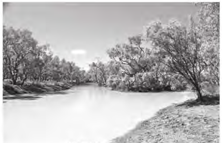
Combo Waterholes looking South