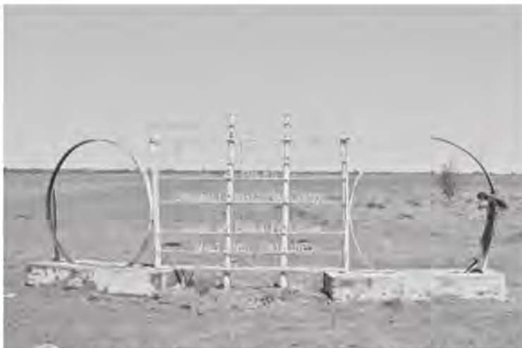
The Cobb and Co marker along the stock route from Kynuna to Winton