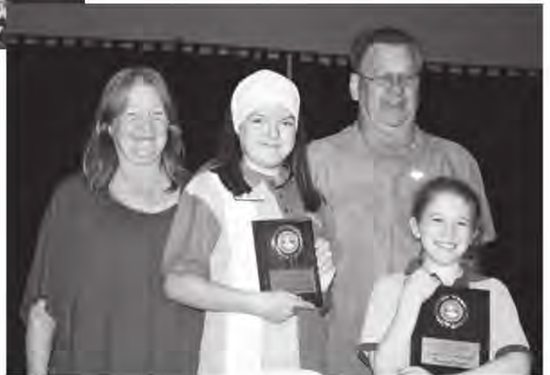
Clover Nolan Award