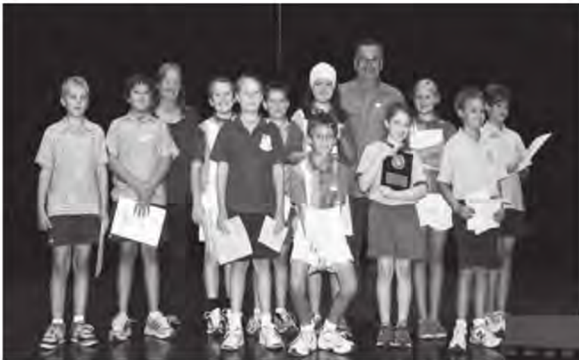
Clover Nolan Award Finalists