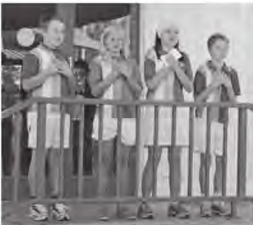
Students from the School of Distance Education practicing.

I believe that the ABPA would be remiss if we didn't get behind supporting this great event for the future of our Culture.