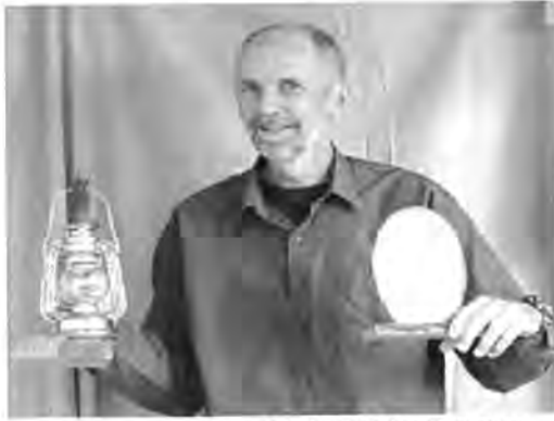
ONE NIGHT AT JOE MAGUIRE'S PUB