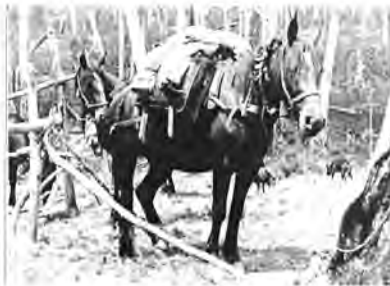
The packhorse was an integral part of the Australian high country and has inspired many a bush poem.

For more details (including accommodation packages) visit www.snowyriverfestival.com.au