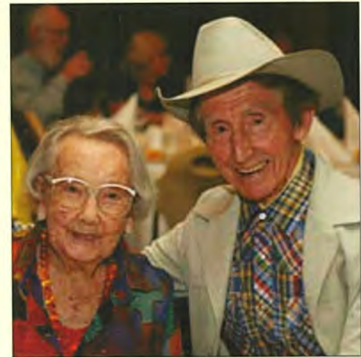
COUNTRY music's famous cowboy