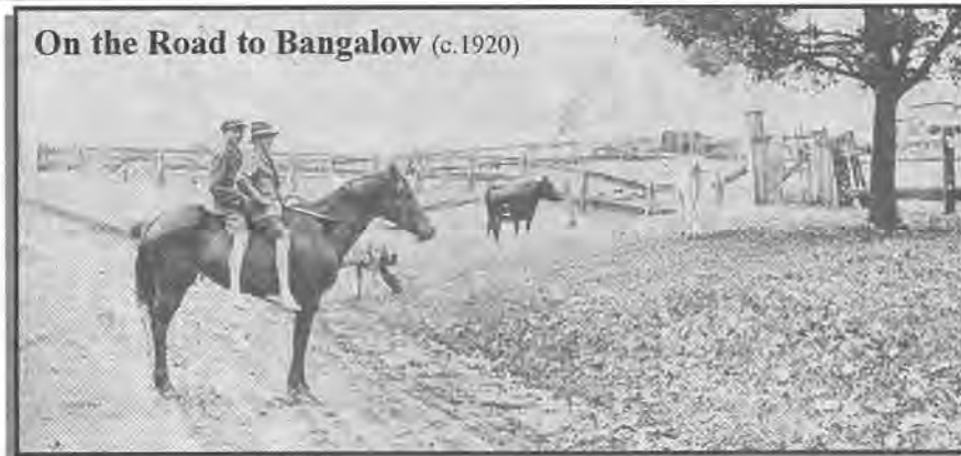
On the Road to Bangalow (c.1920)