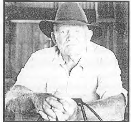
RM WILLIAMS 1908 - 2003