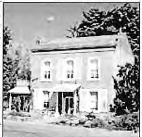
An historic residence in Narrandera