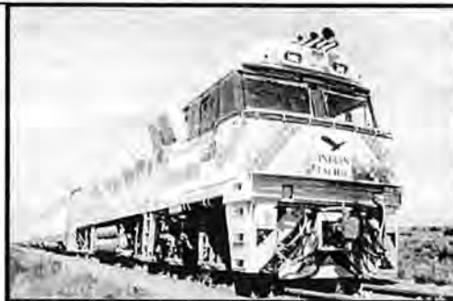
The Indian Pacific

Contact details as per advertisement this page.