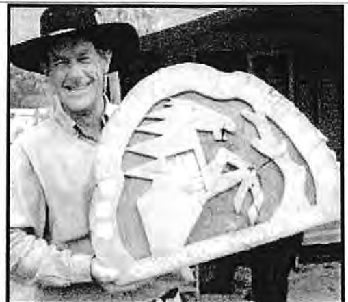
With the 'Big Block of Wood'

Where suddenly there is movement, And she strives with all her worth A gorgeous foal appears, you've just Seen the miracle of birth.