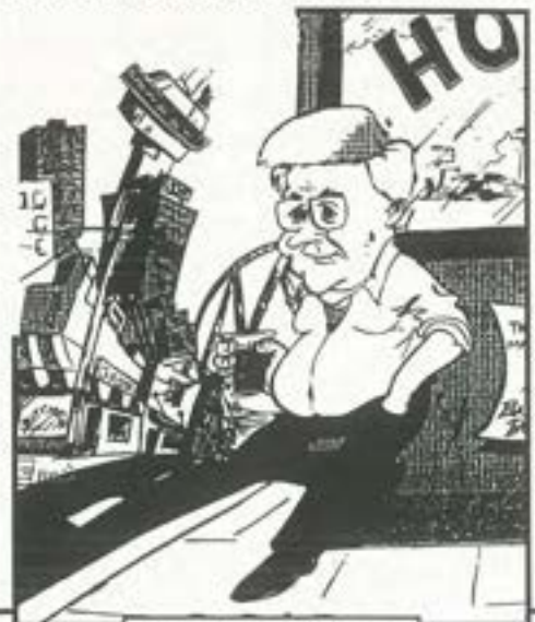
The Balmain Bug