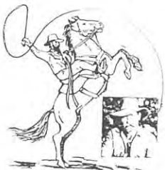
"Capricornia Awakes" and other poems by LANCE LAWRENCE

ALL RIGHTS RESERVED LANCE LAWRENCE COVER DESIGN: NOEL FOLEY