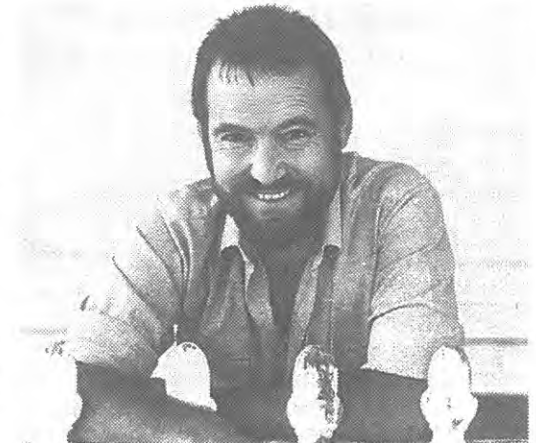
JOHN WILLIAMSON will perform at the opening night concert for the Waltzing Matilda celebrations in April.

Advance tickets can be booked through Ticketworld.