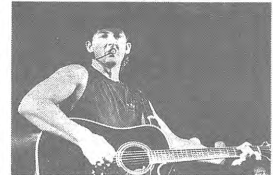
LEE KERNAGHAN part of the line-up of top talent for the centenary in Winton

Celebrate the 100th Birthday Party for Waltzing Matilda AUSTRALIAN BUSH POETRY CHAMPIONSHIP