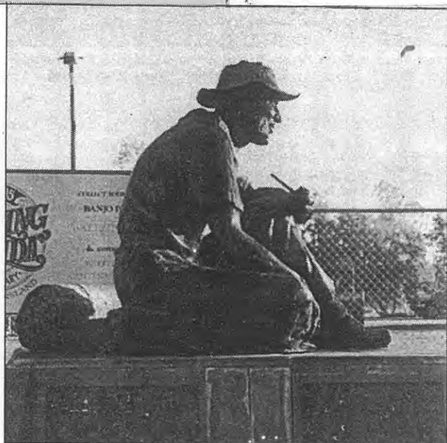
PONDERING SWAGMAN: This monument stands in the main street of Winton and was erected as "A tribute to A. B. 'Banjo' Paterson who wrote 'Waltzing Matilda' in this district in 1895 and to the many swagmen who lie in unmarked graves throughout the country".

The Australian Film Festival will continue in the open air theatre.