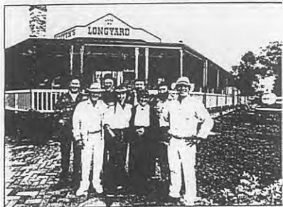
An Evening of Fair Dinkum Verse