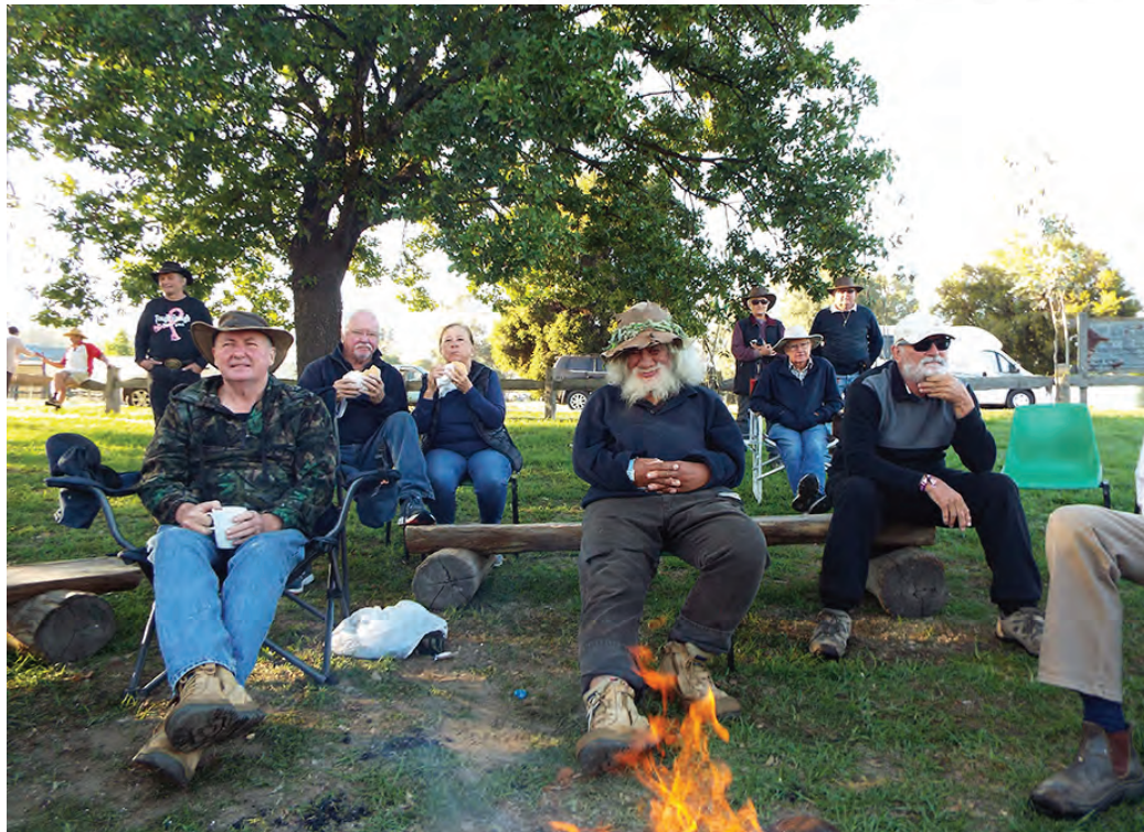
Campbell always knows where the good times are!